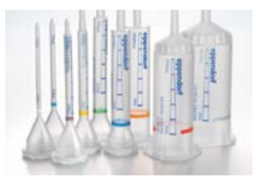
An efficient tool for quick & precise filling of plates or large series of tubes